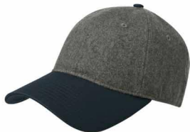
No PMS / 282C