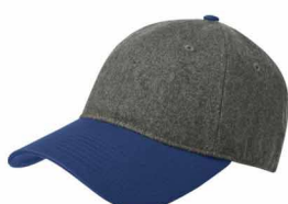
No PMS / 288C