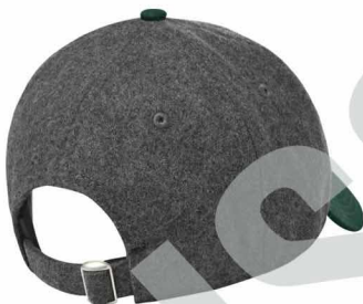
Adjustable D-clip closure