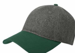
No PMS / 560C

* Please refer to order grid for available colour selection. Limited to stock on hand. No returns.