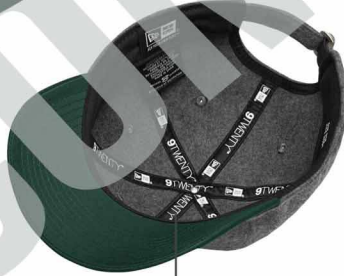
NEW ERA® taping on inside seams