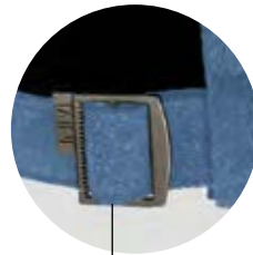
INIVI branded adjustable buckle closure