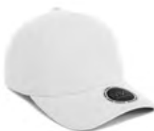
WHITE No PMS