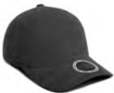
BLACK Black 6C

Textile fabric colours are subject to dye lot variation and will not be exact match to print pantone reference