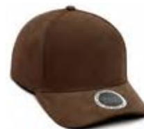
CHOCOLATE BROWN 7589C