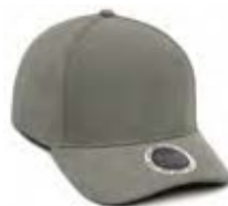
LIGHT GREY 7538C