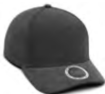
DARK GREY 426C