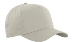
SAND Warm Grey 2C