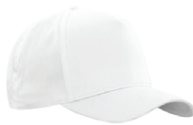
WHITE No PMS