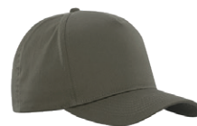
MILITARY GREEN 417C