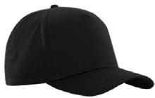
BLACK Black 6C

Textile fabric colours are subject to dye lot variation and will not be exact match to print Pantone reference