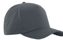
COAL GREY Cool Grey 11C