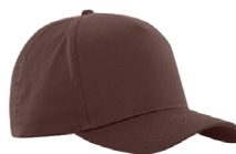
DARK BROWN 7617C