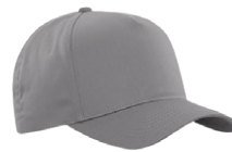
CONCRETE Cool Grey 8C