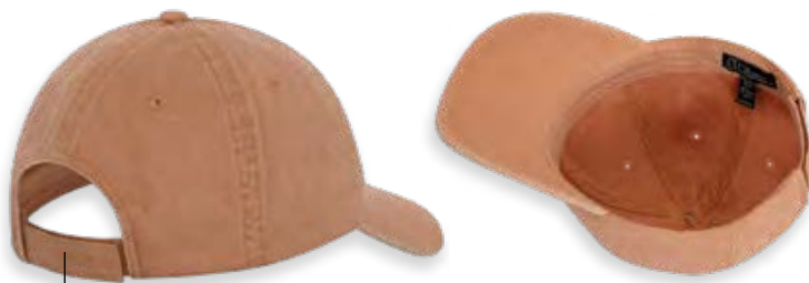
Adjustable hook and loop closure