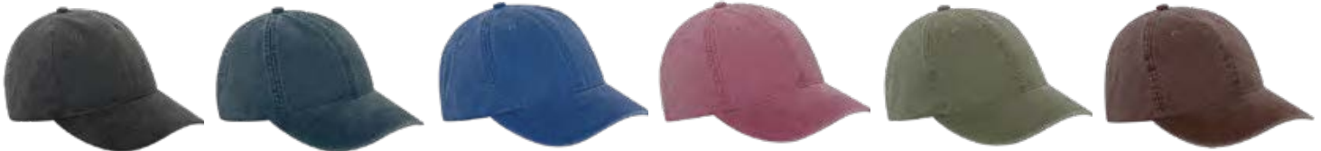
BLACK Black 7C

Textile fabric colours are subject to dye lot variation and will not be exact match to print pantone reference