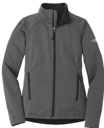
Cool Grey 11C & Cool Grey 8C