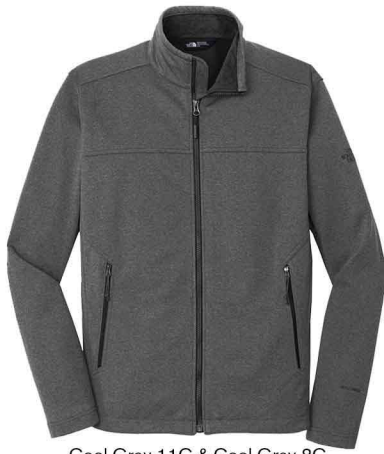
Cool Grey 11C & Cool Grey 8C