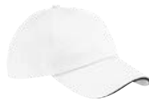
WHITE/NAVY No PMS/296C