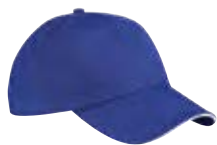
ROYAL/WHITE 294C/No PMS