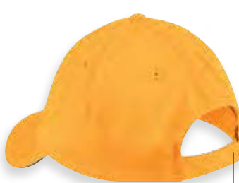
Adjustable hook and loop closure