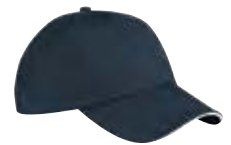
NAVY/WHITE 296C/No PMS