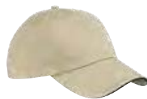
STONE/BLACK 400C/Black 6C