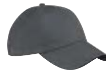
COAL GREY/BLACK Cool Grey 11C/Black 6C