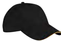
BLACK/GOLD Black 6C/136C