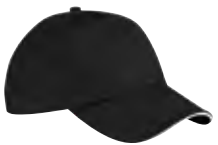
BLACK/WHITE Black 6C/No PMS

Textile fabric colours are subject to dye lot variation and will not be exact match to print pantone reference